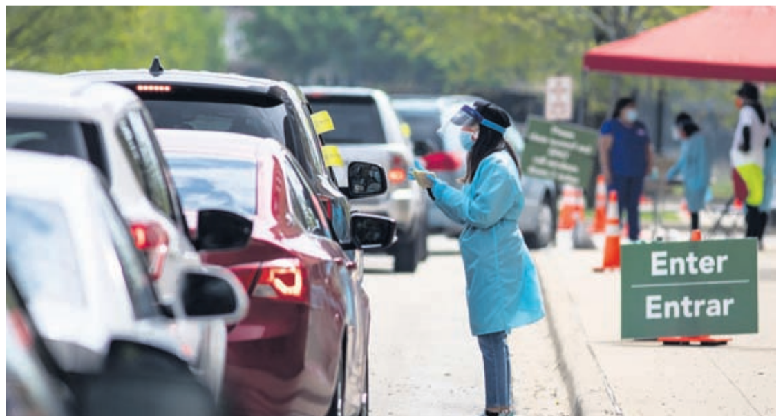
A worker instructs people on how to collect their own nasopharyngeal swab samples to test for the coronavirus at a drive-thru testing site organized by the nonprofit organization Community Organized Relief Effort (CORE) at Dr. Jorge Prieto Math and Science Academy in Chicago on Monday, May 18, 2020.